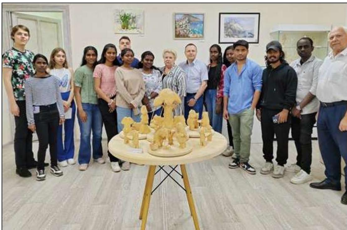
Fig. 3. First-year students of the Medical academy named after S.I. Georgiyevskiy