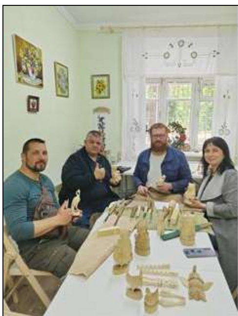
Fig. 2. Master class on Bogorodskoye artistic wood carving