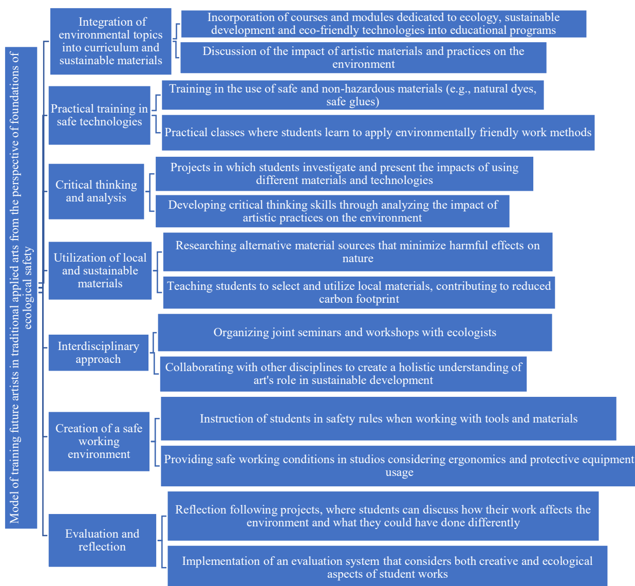
Fig. 1. Model of training future artists in traditional applied arts through the prism of foundations of ecological culture and safety

Special attention should be given to wastes generated during the work process: leftover paint, fabrics, threads, metal shavings, etc., which require proper disposal to avoid environmental pollution. Jewelry making employs certain hazardous substances (mercury and acidic solutions) that can enter the atmosphere and water bodies if precautions are not taken.