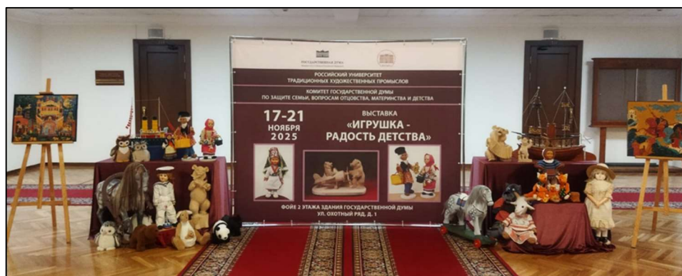
Fig. 1. Exhibition “Toy. Joy of childhood” at the State Duma of the Federal Assembly of the Russian Federation

Participants discussed measures to support manufacturers of children's goods, underscoring the need for market expert involvement in decision-making. They proposed the establishment of a specialized research center focusing on analytics and expertise in children's products and suggested enacting legislation regulating video games aimed at protecting children from harmful influences transmitted via video games and supporting domestic video game producers.