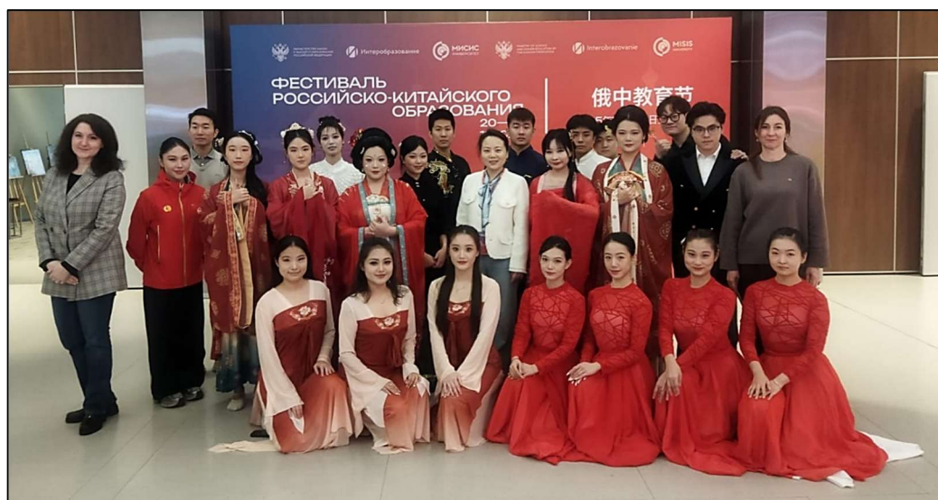
Fig. 13. Participants of the Russian-Chinese education festival

The festival program was extremely diverse: besides the mentioned events, there were master classes on tea ceremony, calligraphy, mahjong, conversational Chinese language, demonstrations of wushu elements, book presentations and much more (Figs. 13-15).