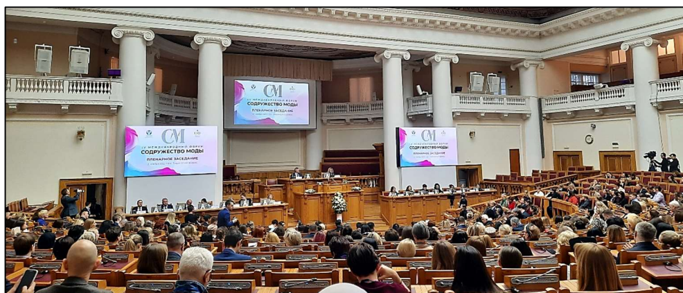
Fig. 6. Plenary session of the IV cultural and economic forum “Commonwealth of fashion” held at the Tauride palace (St. Petersburg)