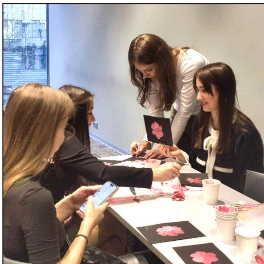
Fig. 14. Workshop on decorative painting technique “Moscow letter”