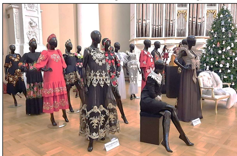
Fig. 7. Art pieces of artistic embroidery and artistic lace-making