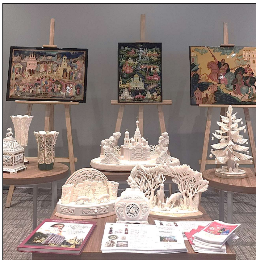
Fig. 11. Exhibition of graduation qualification works of students from the Russian university of traditional art crafts “Splendor of Russian artistic heritage”