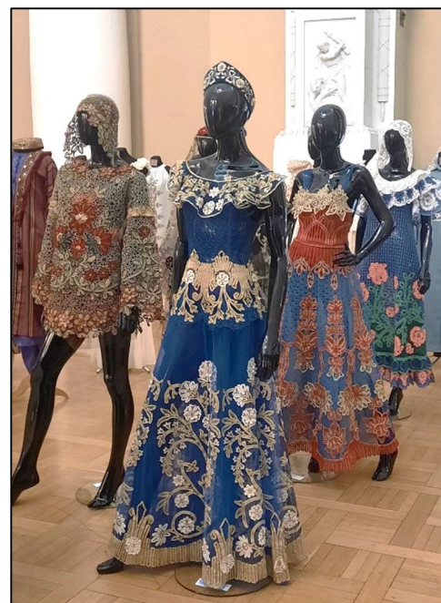
Figs. 8, 9. Art pieces of artistic embroidery and artistic lace-making

Next, the hub of scientific activity shifted again to Moscow, where the Russian university of traditional art crafts participated in the Russian-Chinese education festival, held from November 20-22, 2025, at MISIS University of science and technology, initiated by the ministry of science and higher education (Fig. 10).