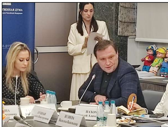
Fig. 4. Round table “Safe childhood: traditional toy as a foundation for harmonious personality development”

training professionals with advanced degrees in unique art forms characteristic of the Nizhny Novgorod lands.