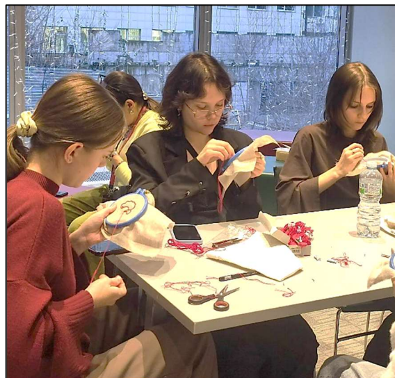
Fig. 15. Workshop on artistic embroidery

Overall, the participation of the Russian university of traditional art crafts in such large-scale events demonstrates sustained interest in the results of the university's research and artistic creativity not only within Russia but also internationally.