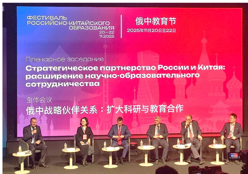
Fig. 10. Opening of the Russian-Chinese education festival