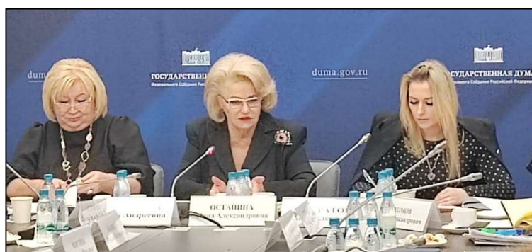
Figs. 2, 3. Round table “Safe childhood: traditional toy as a foundation for harmonious personality development”

Concurrently, in St. Petersburg, the Tauride palace hosted the annual fourth edition of the cultural and economic forum “Commonwealth of fashion” (November 19-21, 2025). The university showcased 24 pieces of artistic embroidery and artistic lace-making to the public (Fig. 6). Visitors praised the high quality, beauty and uniqueness of the exhibited items (Figs. 7-9).