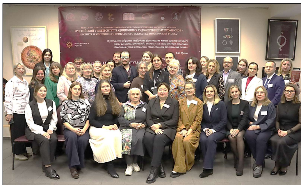
Fig. 6. Participants of the IV International forum “Traditional art crafts and professional higher education: modern challenges and prospects”

The forum highlighted that collaboration between Russian and foreign educational institutions in the field of traditional applied arts has significant potential for further development.