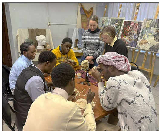
Fig. 5. Masterclass on Bogorodskoye artistic woodcarving

Through discussions on topical issues, exchange of experience among leading specialists from different regions of Russia and abroad and the opportunity to assess the high professional level of project and performance skills exhibited by students of the Russian university of traditional art crafts at exhibition venues, the forum confirmed its relevance.