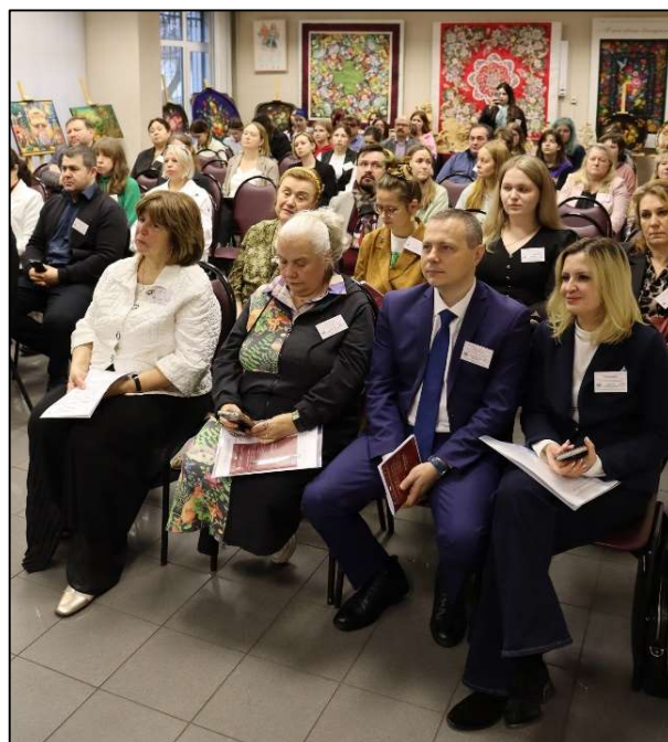
Fig. 1. IV International forum “Traditional art crafts and professional higher education: modern challenges and prospects”