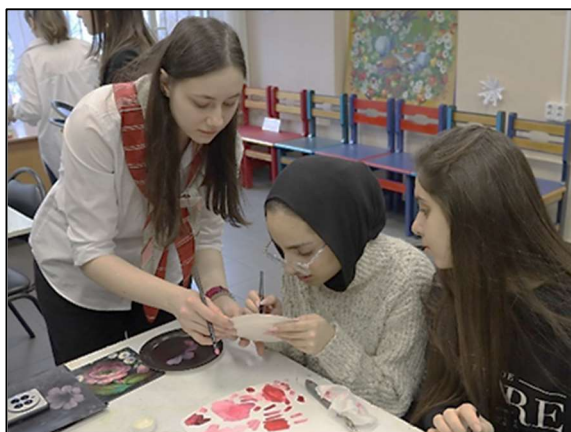
Fig. 4. Masterclass on Zhostovo decorative painting technique